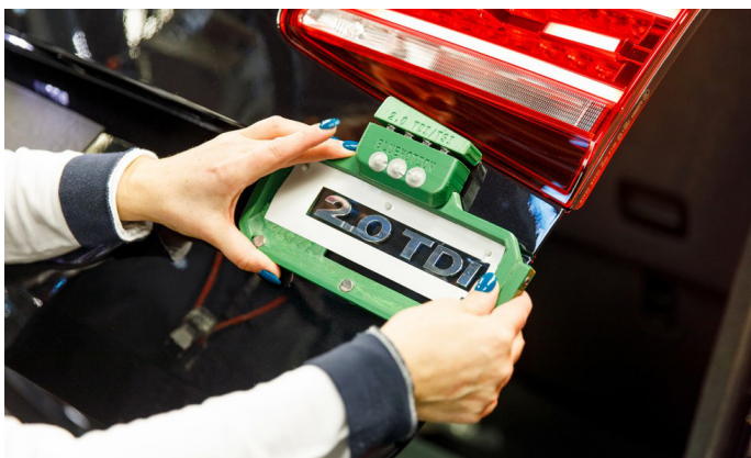
No tooling or machining is required to build a model. The cost is far less than traditional manufacturing methods, and the results can be tailored to match exact requirements.