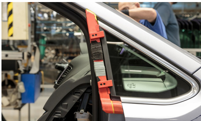
A previously impractical jig or fixture design is now a viable option; function and performance become the main drivers of design, not cost or time.