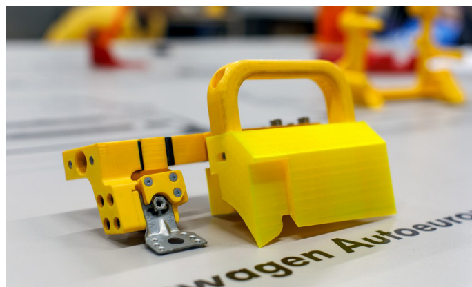
Printing parts on-demand in-house accelerates the build and delivery process. Manufacturers using Ultimaker 3D printers often see a 40% to 90% lead time reduction.

3D printing enabled them to test construction and assembly tools, reduce their development times by 95%, and avoid the bureaucratic process of dealing with suppliers. By printing prototypes in-house, Volkswagen Autoeuropa achieved a 91% cost reduction (approximately €150,000 per year).