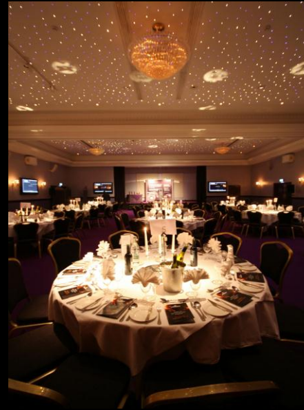
NAA Annual Dinner