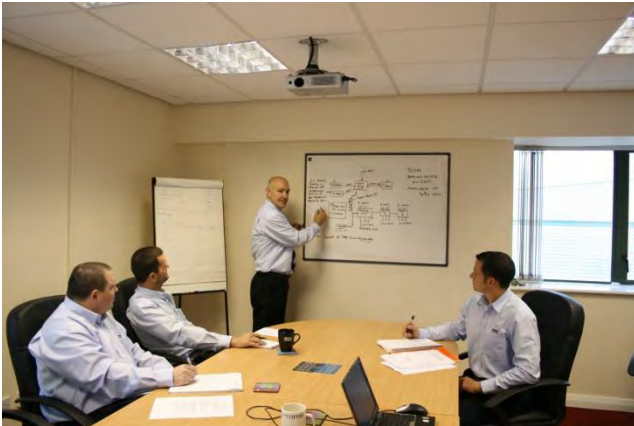
R & D APQP Meeting