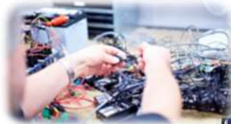
Car Mechatronics New technologies