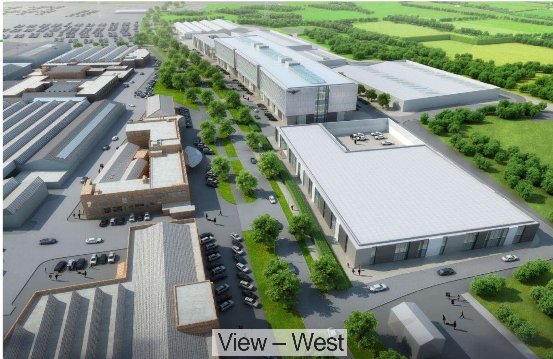
View – West