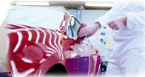
Paint Finish Craftsmanship