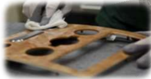
Wood Veneer Craftsmanship Group Centre of Excellence